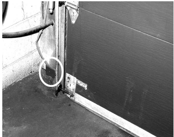
Door with Photo Eye

The electric eye is mounted 5 to 6 inches off the floor and senses objects in its path. If your garage door opener does not have an electric eye system, you may be able to upgrade it without replacing the entire system